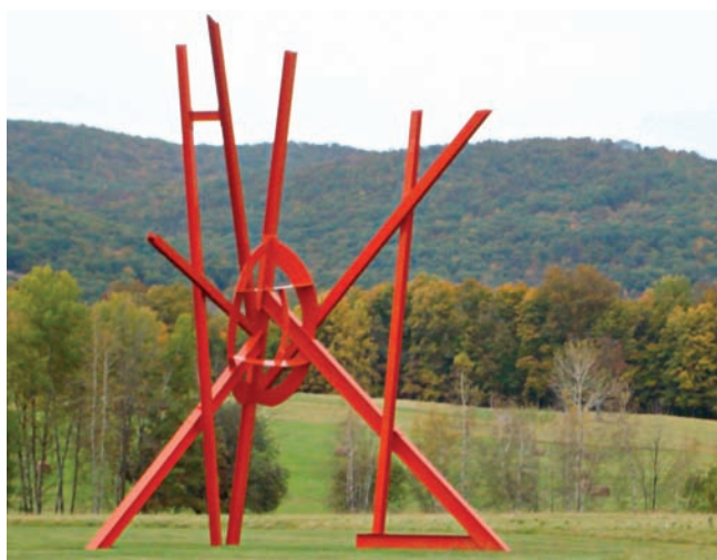
At Storm King Art Center, sculptures such as this Richard Serra piece adorn the landscape.

A tour of the area made famous by the landscape paintings of the Hudson River School would not be complete without a