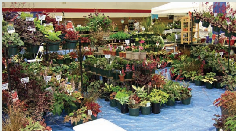
Along with gardening seminars, the Oregon Coast Gardening & Landscaping Expo will feature dozens of vendors offering plants and garden-related merchandise.