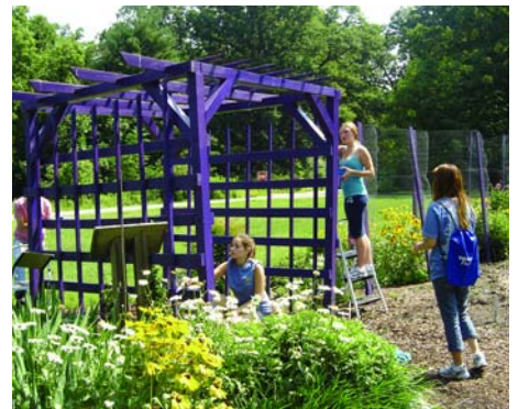
A group of CSJP interns renovate an arbor at the Washington Youth Garden last summer.

FOR THE SECOND YEAR in a row, the AHS will participate in the ExxonMobil Community Summer Jobs Program (CSJP), which will provide a grant for a youth programs intern to spend the summer at River Farm. The intern will assist with various AHS education programs, such as the National Children & Youth Garden Symposium July 19 to 21 in Chaska, Minnesota. He or she will also participate with other interns on a community service volunteer project.