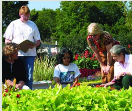
A variety of classes are offered year round at the Minnesota Landscape Arboretum.

The Minnesota Landscape Arboretum in Chaska features a variety of classes on horticultural themes in its Arboretum Gardening School. Each seasonally appropriate series runs for four consecutive Saturdays. Attendees receive Professional Development Hours,