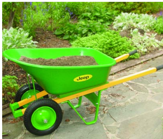
Jeep’s wheelbarrow features flat-rib tires that eliminate the need to periodically inflate them.

The distinction between wheelbarrows and garden carts can be a bit blurry, but in general wheelbarrows have a single wheel and