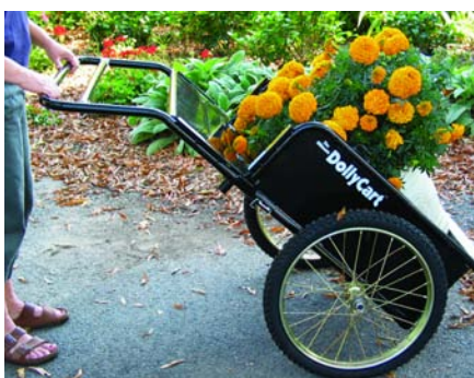
Reconfiguring the handle and a side slat, the DollyCart from Plow and Hearth, shown here as a dolly, converts into a cart.

A good wheelbarrow or garden cart eases the strain on your back and helps