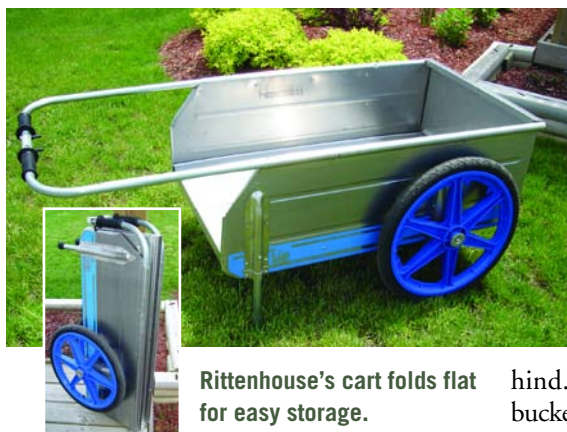
Rittenhouse's cart folds flat for easy storage.

Yardiac , Greenville, SC. (864) 288-1661. www.yardiac.com .