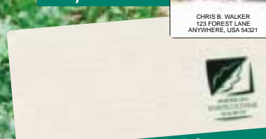
AHS Cotton Checkbook Cover