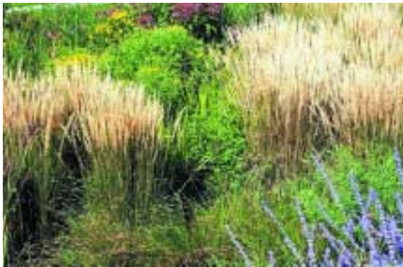
Above and top: At the Maria Bates Rain Garden in St. Paul, Minnesota, students from a local elementary school planted the garden with a mixture of native and adapted exotic plants.

The Seattle and St. Paul rain gardens are voluntary efforts to reduce stormwater runoff, but some municipalities are moving toward mandatory programs.