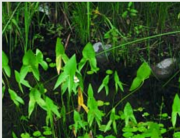
A rain garden at Indian Hill School in Brown Deer, a suburb of Milwaukee, Wisconsin, filters water that eventually drains into this pond. The rain garden and pond are integral parts of the school's outdoor classroom activities and science projects.