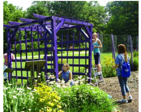
A group of CSJP interns renovate an arbor at the Washington Youth Garden last summer.

FOR THE SECOND YEAR in a row, the AHS will participate in the ExxonMobil Community Summer Jobs Program (CSJP), which will provide a grant for a youth programs intern to spend the summer at River Farm. The intern will assist with various AHS education programs, such as the National Children & Youth Garden Symposium July 19 to 21 in Chaska, Minnesota. He or she will also participate with other interns on a community service volunteer project.