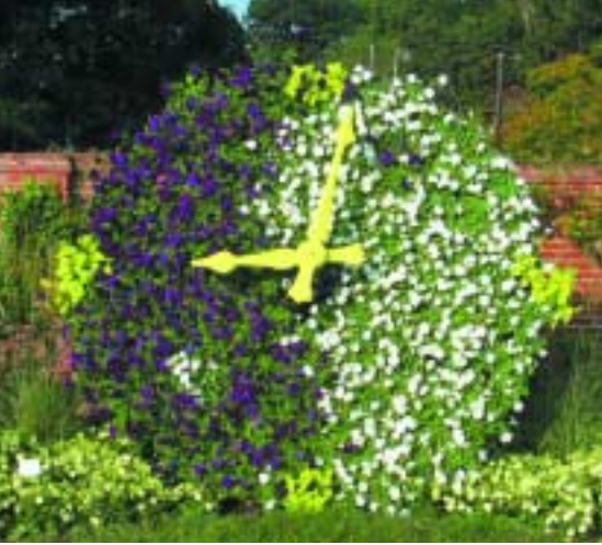
Above: Purple and white petunias and sweet potato vines create a timely display in Goldsmith Seeds' floral clock. Right: Centerton Nursery's "Performance Hi Way" is paved with a dark-leaved oxalis and other plants. Bottom right: A statue of Pan from Campania provides a fitting focal point for Saunders Brothers' boxwood allée.