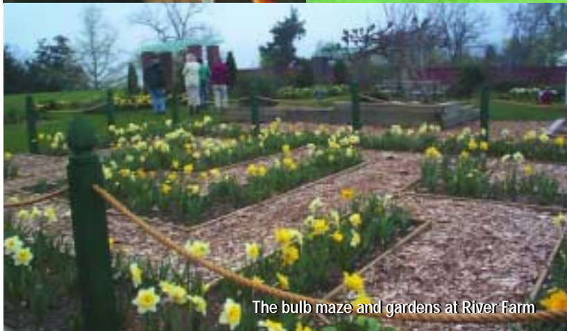
The bulb maze and gardens at River Farm