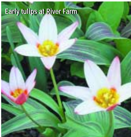
Early tulips at River Farm

So if you didn't get a chance to come to this year's Washington Blooms! festival, plan on coming next spring!