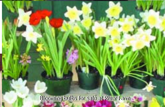
Blooming bulbs for sale at River Farm