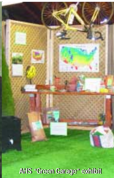
AHS "Green Garage" exhibit