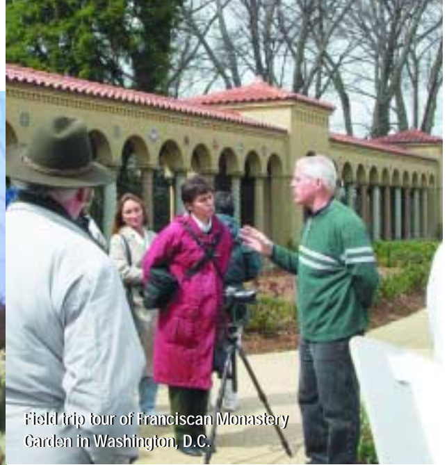
Field trip tour of Franciscan Monastery Garden in Washington, D.C.