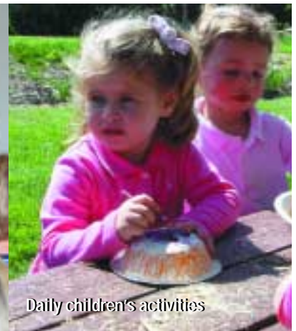
Daily children's activities