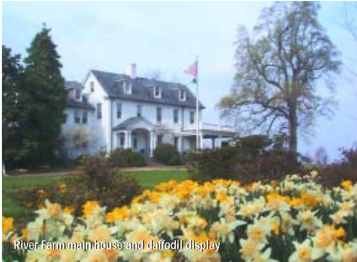
River Farm main house and daffodil display